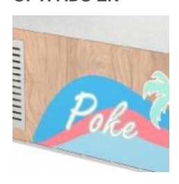
Customized adhesive sticker