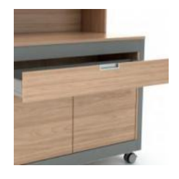
Single big drawer